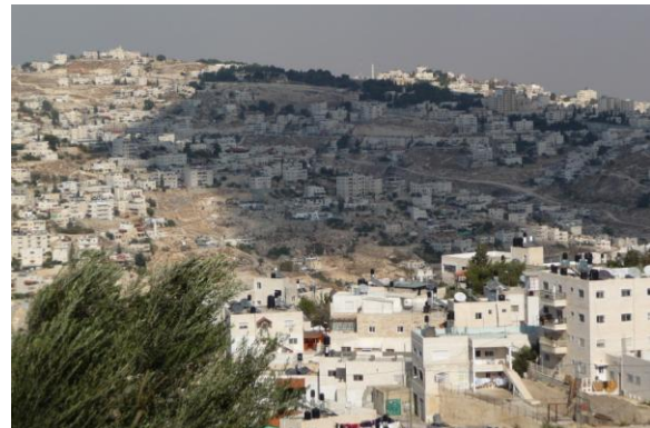
Sun and clouds on the hills of Jerusalem

do in her life through the love of the Messiah. Please begin praying for her and her issues even before we arrive there. Also, pray that we will be able to connect with her and find a way to reach her with hope and love. We are praying that G-d will use the quietness of just two people in her home instead of a group, to inspire more intimate conversations about her needs and struggles.